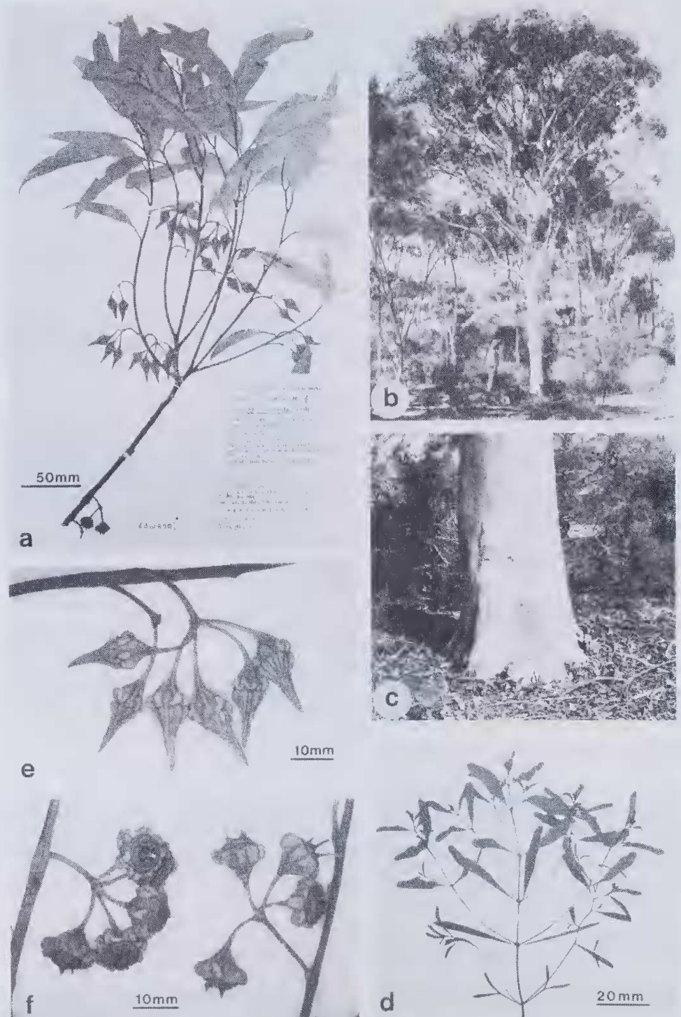
Figure 1. Eucalyptus ornata a—Holotype, Taylor 2244 (CBG). b—Habit. c—Bark. d—Seedling, from Crisp 5522 (CBG 8007431). e—Buds, from isotype (CBG). f—Fruits, from Crisp 5522 (CBG).